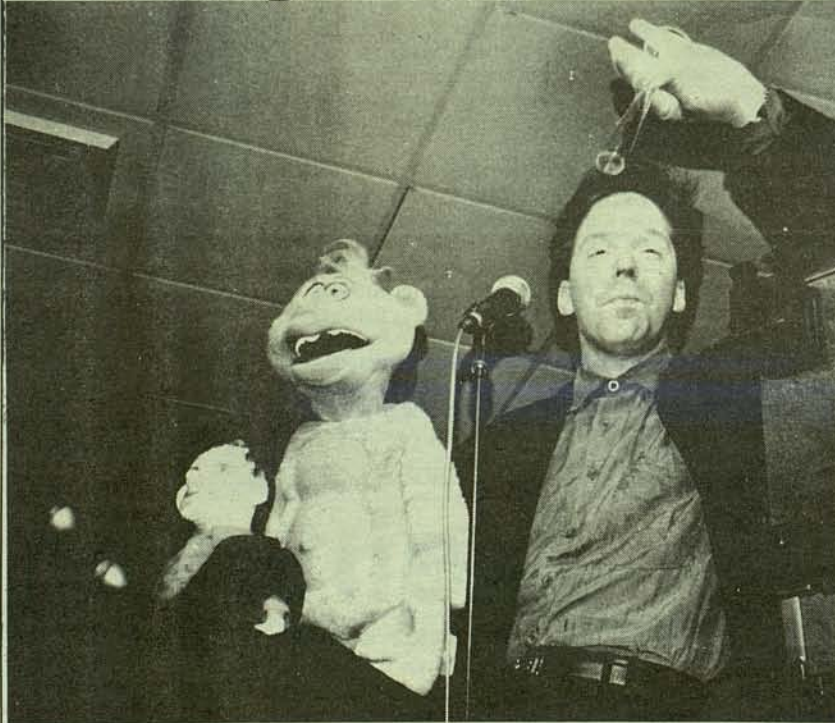
Ventriloquist Jeff Dunham, his Woozil Peanut, and Peanut's Dummy perform in FAU's Rathskeller Monday night.