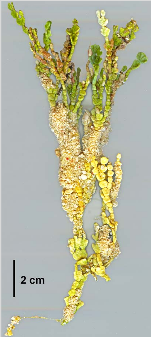
Fig. 3 Single thallus separated from Fig. 2 population showing rhizoidal proliferations binding sand along entire length of buried segments

Linton's Beach and Harbour Cottages, Harbor Branch Oceanographic Institution (HBOI Contribution No. 1670) and the Smithsonian Marine Station at Fort Pierce (SMS Contribution No. 689).