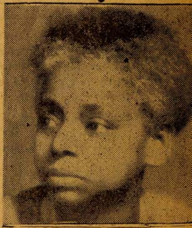
WILLIANA BURROUGHS Communist Candidate for Comptroller