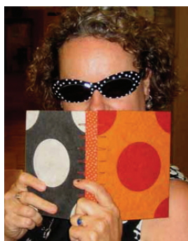
What's Emily's big secret?

You'll go home with some new knowledge and helpful tips. . . and two new limited edition letterpress printed books to add to your collection.