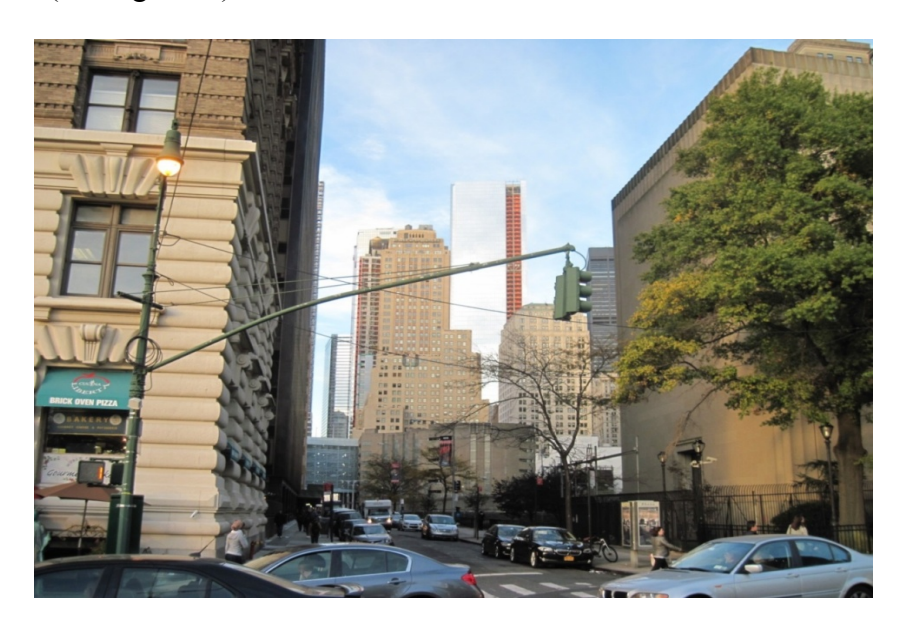
Figure 8. View of Washington Street northward from Battery Place (2013). The large gray building behind the tree on the right is the Brooklyn Battery Tunnel and Triborough Bridge Authority portal. Note the absence of any structures to the north of that building for some distance. All such structures were demolished to construct the tunnel.

But the 1940s brought notices to vacate, wrecking balls, and ultimately the denouement of Little Syria. Residents found themselves "ousted by the construction of the Brooklyn Tunnel," needing to find new places to live. Without a local Arabic-speaking population, Syrian businesses could no longer sustain themselves, and so left the former ethnic colony. Lower Washington Street now contains a barren stretch of vacant land. (See figure 8.)