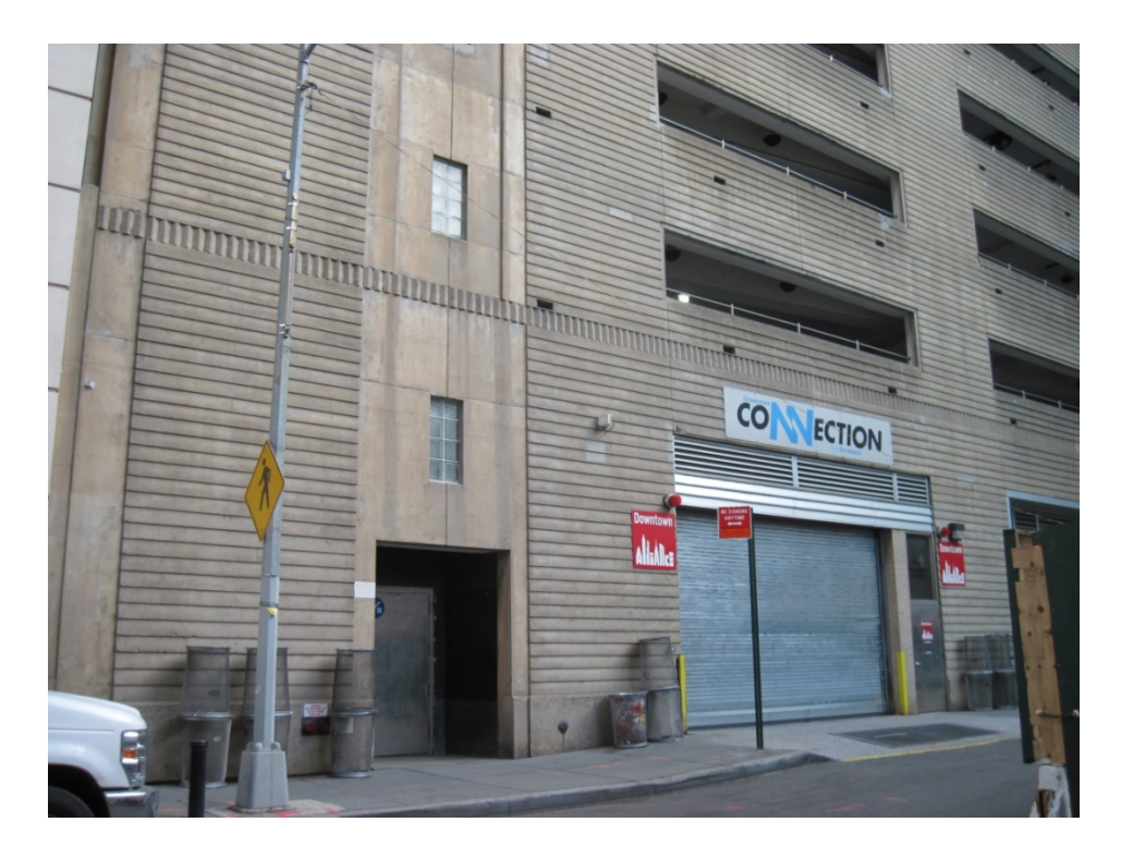
Figure 11. View of 85-87 Washington Street, on western side of Battery Parking Garage (2013). The smaller doorway on the left is the former location of the Sheik Restaurant, 87 Washington Street. For a graphic illustration of change over time and space, contrast this image with that of figure 4.