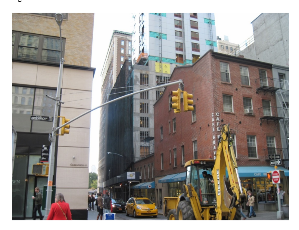
Figure 10. Brick building on the northwest corner of Greenwich and Rector Streets (2013). The much taller building under construction behind it is adjacent to St. George's Catholic (Melkite) Chapel on Washington Street.

neighborhood is long gone. As a Paris Review writer put it in 2013, "Of Little Syria, there is nothing."