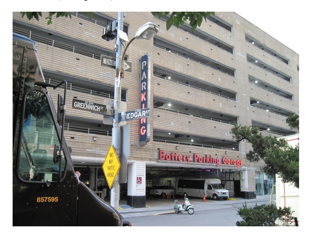
Figure 9. Battery Parking Garage, a massive structure comprising a large space between Greenwich and Washington Streets (2013). The view here is of the eastern side of the garage, looking northwestward from Edgar Park, a small triangle of land, with bench plaques commemorating the former Syrian colony and its residents. The triangle also appears on figure 2.

In May 2013, the Arab American National Museum held an exhibit, "Little Syria," in space rented on the first floor of the Brooklyn Battery Garage, a structure erected where several tenements and establishments on Washington and Greenwich Streets once stood. (See figure 9.)