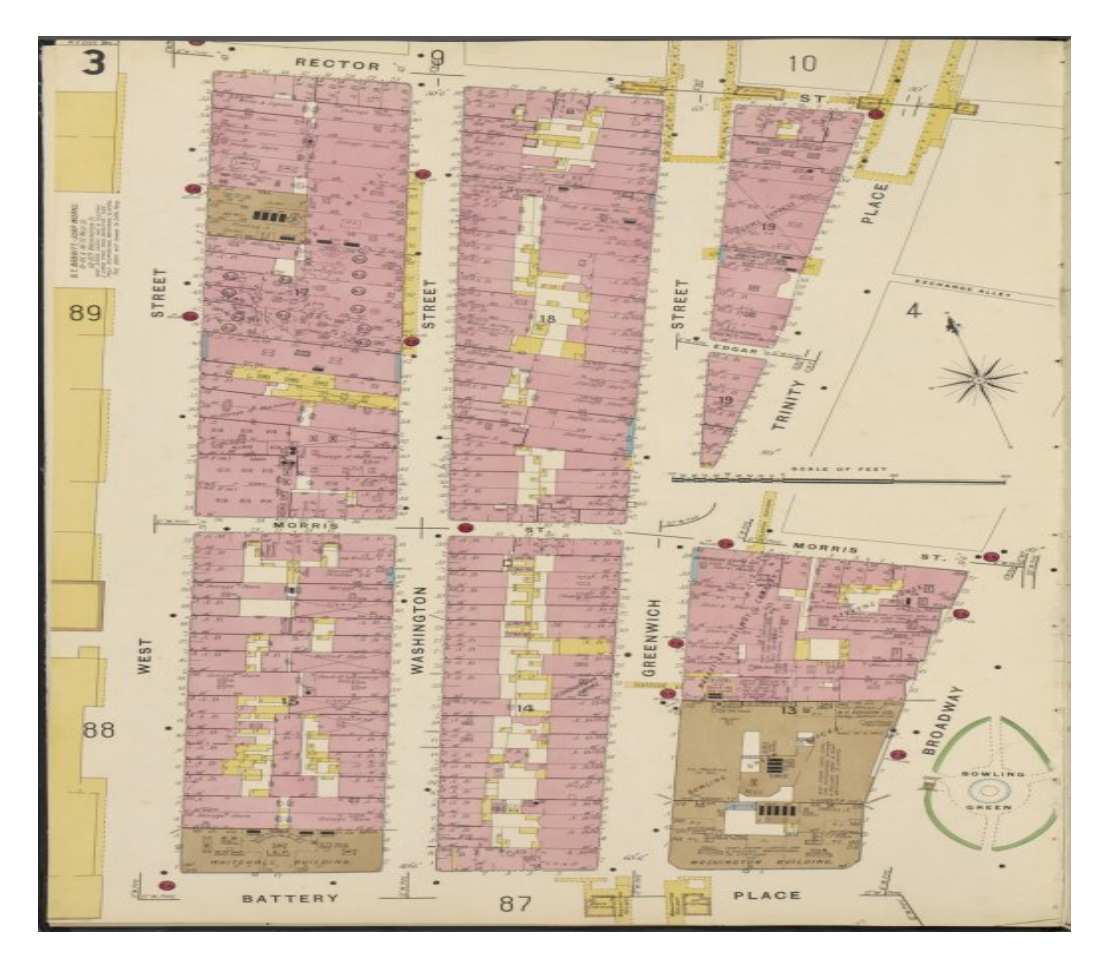
Figure 2. Map of the lower portion of Little Syria, from Battery Place north to Morris Street, showing the divergence of Greenwich Street and Trinity Place to the east (1905). Broadway lay a block further east. To the south of Little Syria, directly across Battery Place, stood Battery Park. Today, the small triangle at the vortex of Greenwich Street and Trinity Place comprises Edgar Park.

identifying the same borders as Miller had determined seventy years earlier.<sup>122</sup> Finally, and perhaps indicative of the unresolved nature of the geographic boundaries, entries in the Encyclopedia of New York City vaguely described Little Syria historically as the area "around Rector and Washington Streets," without committing to specific borders.<sup>123</sup>