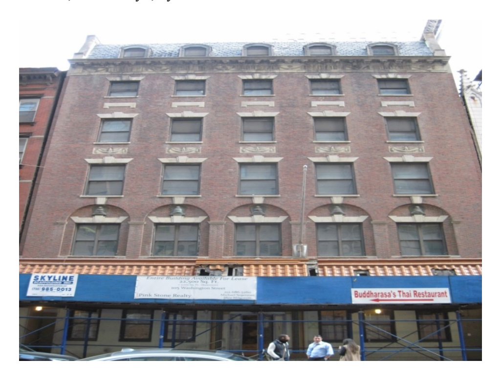
Figure 3. Former Downtown Community House, 105-107 Washington Street (2013). Constructed in the mid-1920s, this facility catered to the personal needs of local immigrant families. Currently vacant, it sits between a tenement house to the north and St. George's Catholic (Melkite) Chapel to the south.

1,867,312 in 1930. By contrast, Brooklyn's population rose nearly twenty-seven percent, from 2,018,356 to 2,560,401, over the decade. The 1930 census found 6,065 Syrians living in New York City, 5,353 in Brooklyn and, strikingly, a mere 508 in Manhattan. The Syrian World , published in Little Syria, could be purchased at multiple locations across the river, in Brooklyn, by 1933. 189