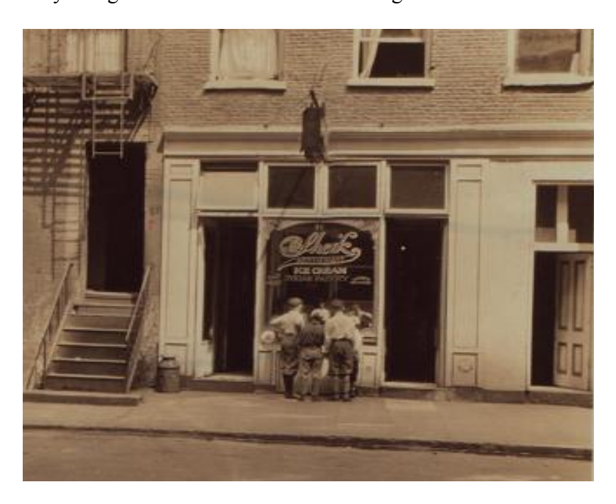
Figure 4. Children looking in the window of The Sheik Restaurant, 87 Washington Street, in the heart of Little Syria (1929). Residential entrances appear on either side of the restaurant, and residential windows appear above it. Notice the open doors.

most ingenious, entreprising [sic] and crafty business men of the emigrant races." Exuding ethnic pride, if not humility, the editors described Syrian immigrants as descendants of the ancient Phoenicians, "undeniably the great founders and masters of maritime commerce," who, like their forbears, "easily shape themselves to fit such new surroundings" as they find themselves in—in this instance, the United States. On each page, listings appeared in English on the left, and in Arabic on the right, with a vertical line separating the two. Advertisements were almost entirely in Arabic, except for names and addresses (and occasional sentences). The bilingualism of this directory showed that Syrian immigrants had not, as of 1908, transformed themselves into English-speakers only. Many clung to Arabic and did not soon let go. 197