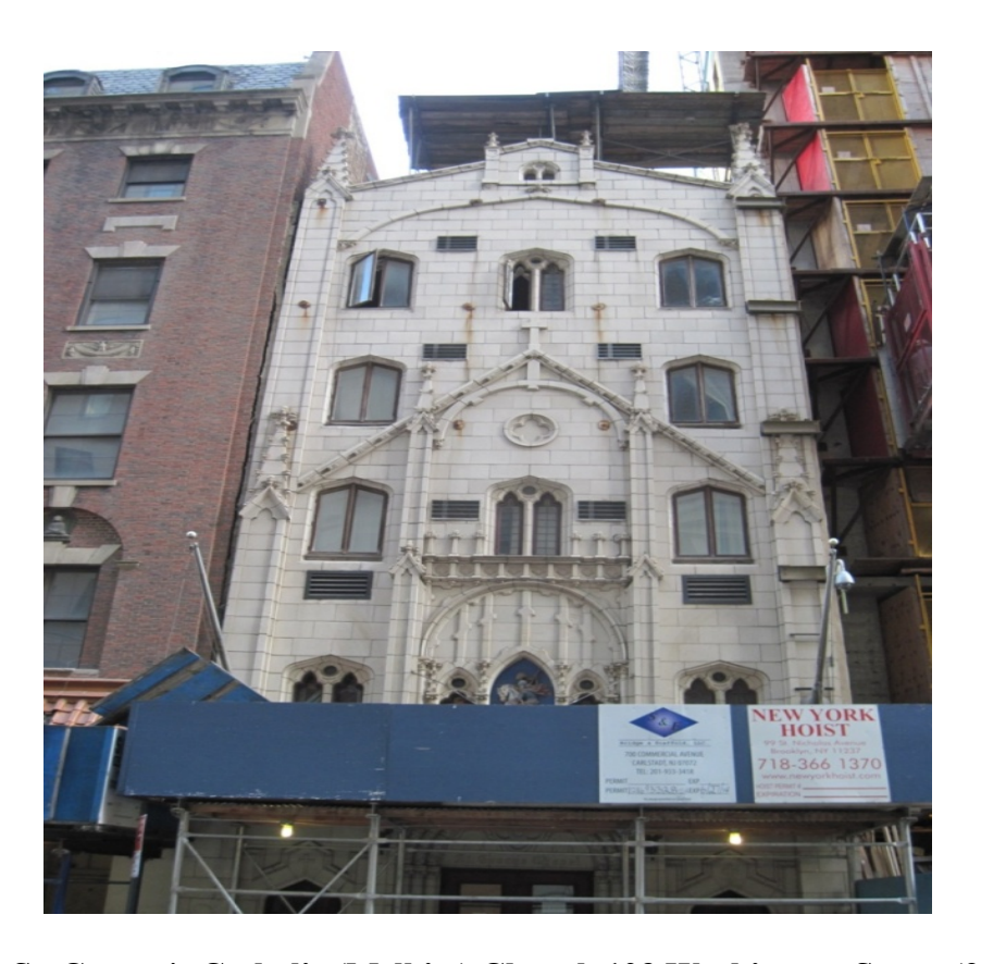
Figure 5. St. George's Catholic (Melkite) Chapel. 103 Washington Street (2013). This is the sole structure in Little Syria officially landmarked for historic preservation. To its immediate north is the building that formerly housed the Downtown Community House. To its immediate south is a far taller building, currently under construction.

The transformation in reportage on Eastern Catholic customs between 1881 and 1899 showed that Maronites and Melkites in New York readily assimilated into mainstream Catholicism. In January 1881, the New York Times gave a detailed account of a Mass celebrated by Eastern Catholics, comparing and contrasting the ceremony with a Latin Mass. The priest spoke not in Latin but in Syriac, except for the reading of the Gospel, which he read in Arabic; he wore different robes from Latin priests; he offered the bread and wine before, rather than after, the uttering of the Creed; he omitted part of the Mass, and amended it, by holding a lit candle while blessing the people at the